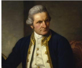
Captain James Cook